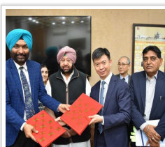
PUNJAB INKS MoU WITH SINGAPORE'S CIG TO EXPLORE LEADERSHIP TRAINING, SHOWCASE