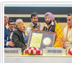
CAPT AMARINDER CONFERRED WITH 10th BCS 'IDEAL CHIEF MINISTER' AWARD FOR UNIQUE INITIATIVES TO