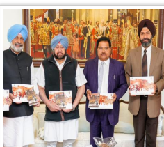
Punjab Chief Minister Captain Amarinder Singh Released A Booklet 'Because We Haven't Forgotten...' Along With A