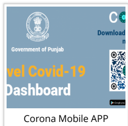
Corona Mobile APP